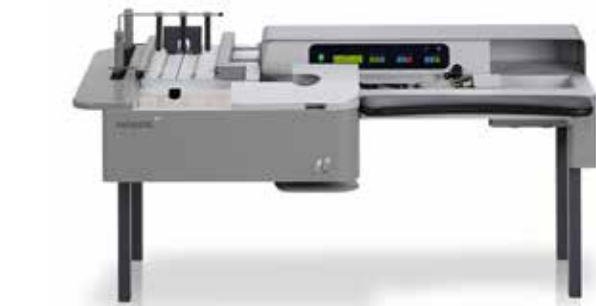
Automatic letter openers