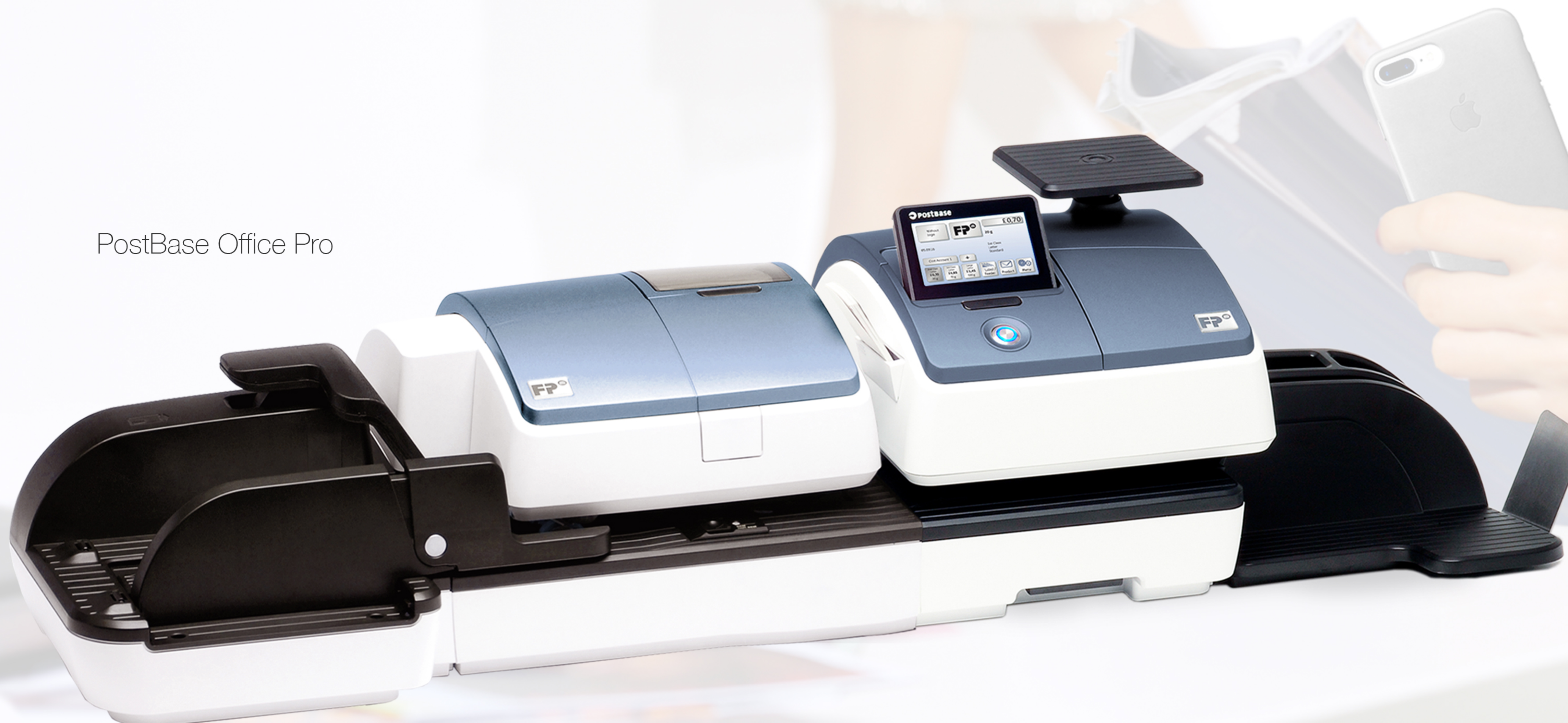
PostBase Office Pro