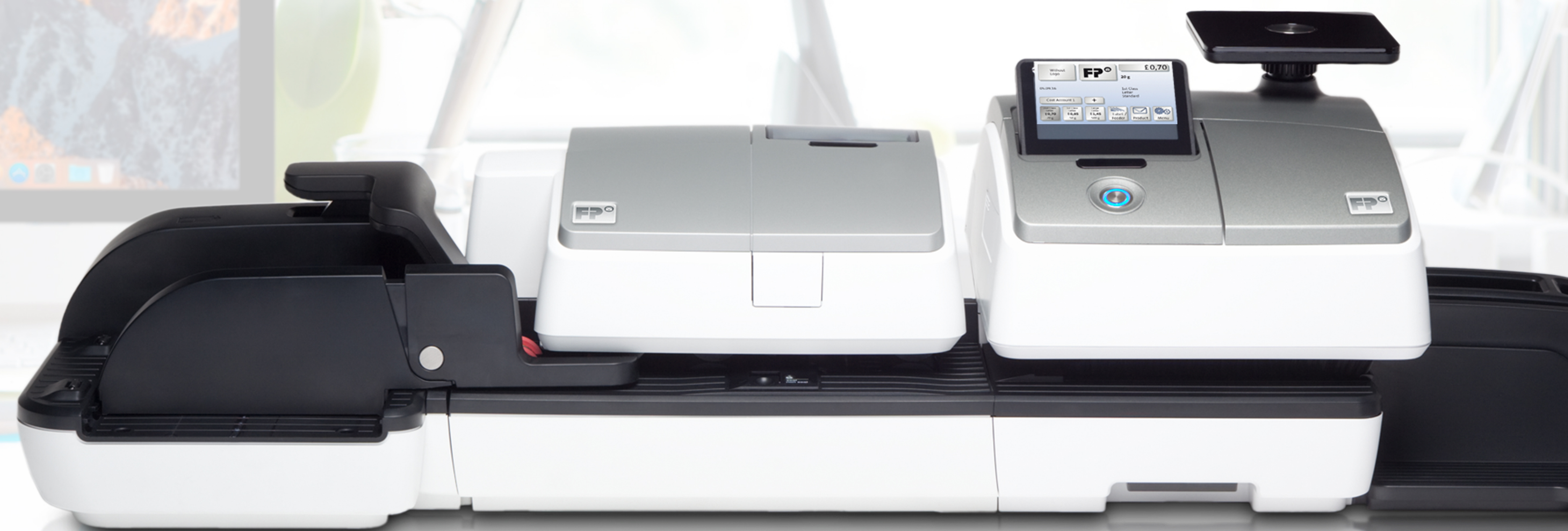
PostBase Enterprise +Pro

Fully automatic Postbase Enterprise +Pro processes up to 85 letters per minute with automatic mail feeder as standard and Wi-Fi option; making Postbase Enterprise +Pro exceptionally flexible and powerful. With Navigator Plus, Postbase Enterprise +Pro becomes a powerful reporting tool with regards to your postage costs, allowing you to analyse and export your postage data.